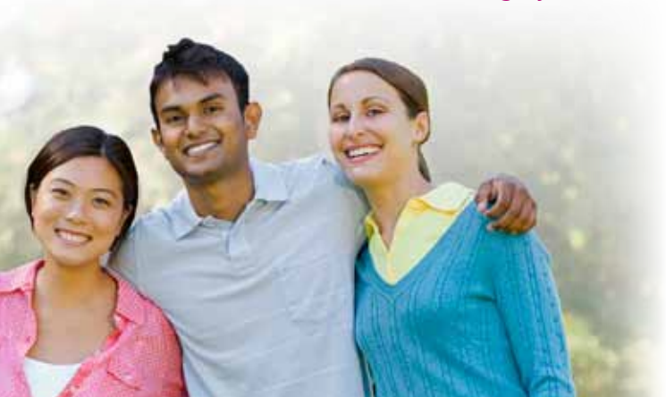
Single-Site™ da Vinci Surgery